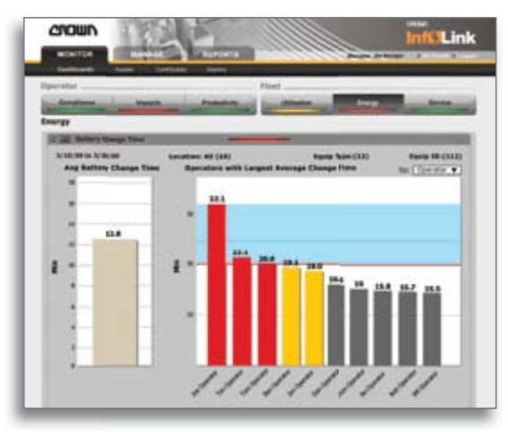
InfoLink offers online access to vital operator/fleet data.

it to automate the inspection checklist process, eliminate paper storage and gain instant access to inspection records. In addition,