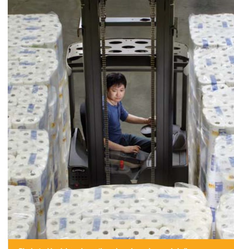
Block stacking inbound or outbound goods can be a real challenge Pack it too tight and you risk product damage and slow operation. Pack it too loose and you're wasting valuable space. The unmatched visibility and responsive controls on the ESR 5200 Series let you pack it just right.

Even with its narrow 1120 mm chassis width, the ESR 5220 can easily fit an 800 mm load between the outrigger legs thanks to its specially designed narrow outriggers. On the wider ESR 5260 you can choose a narrow outrigger option, allowing a 1000 mm load to fit between the outriggers.